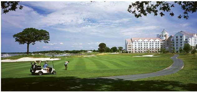
Hyatt Regency River Marsh